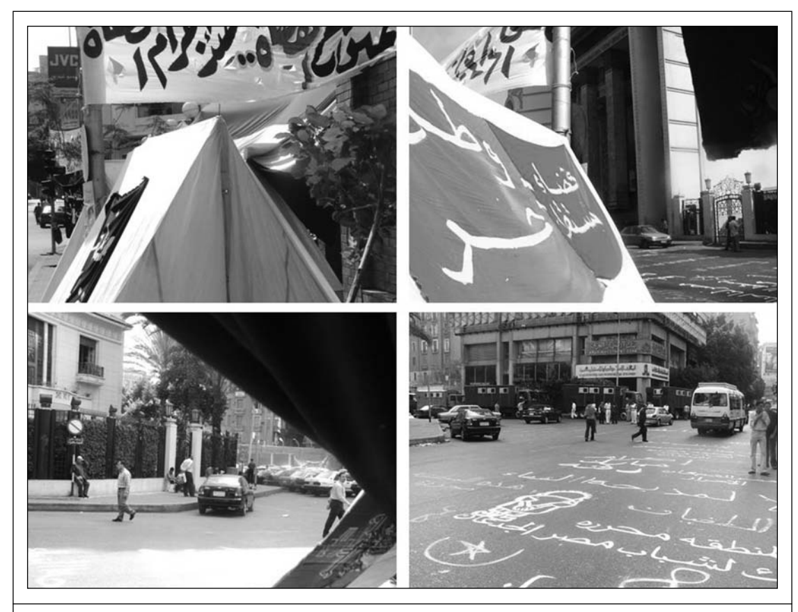
PHOTO 2 Photo blogs of sit-in, Judges' Club, Unions Street

also to support judges who faced charges for reporting September 2005 presidential election violations. This event stunned the government and major precautions were taken to prevent the urban youth and bloggers' demonstrations. During the second sit-in, the government planned to overpower the demonstrators by arranging a counter-demonstration by their own supporters. Although anti-riot police forces cordoned off the protest and were able to divide the masses, this did not stop demonstrators from trying to break through cordons, resulting in more confrontations. Thousands of demonstrators made it to central Cairo, where police chased them down and reportedly arrested hundreds. After five days, Unions Street was completely empty as anti-riot security forces and police vehicles occupied the city centre.