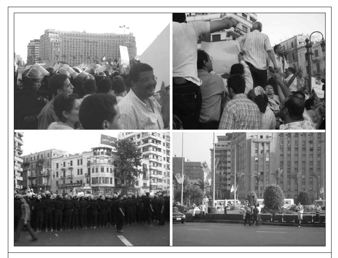
PHOTO 1 Photo blogs of street demonstrations – Midan al Tahrir (Liberation Square)

50. Malone, K (2002), "Street life: youth, culture and competing uses of public space", Environment and Urbanization Vol 14, No 2, October, pages 157–168; also Batuman, B (2003), "Imagination as appropriation. Student riots and the (re)claiming of public space", Space and Culture Vol 6, No 3, pages 261–275.